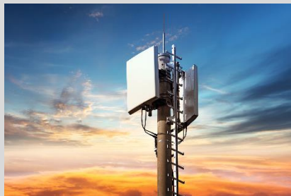
Telecomm., Optical Fibre, Coaxial

Halogen-free, low smoke, thermoplastic, highly oil and extra fuel resistant, flame retardant compound for the sheathing of data communication, low and medium voltage cables for moving applications. (e. g. Telecomm/Shipboard/Green Energy)